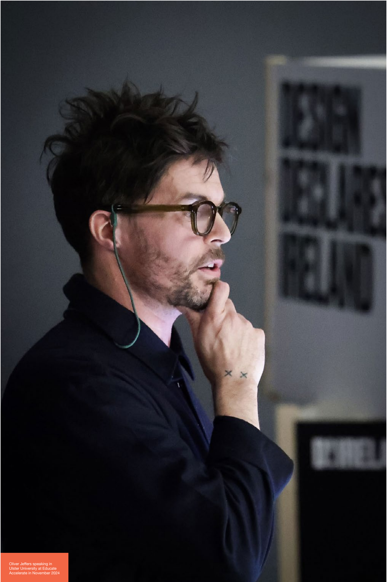
Oliver Jeffers speaking in Ulster University at Educate Accelerate in November 2024