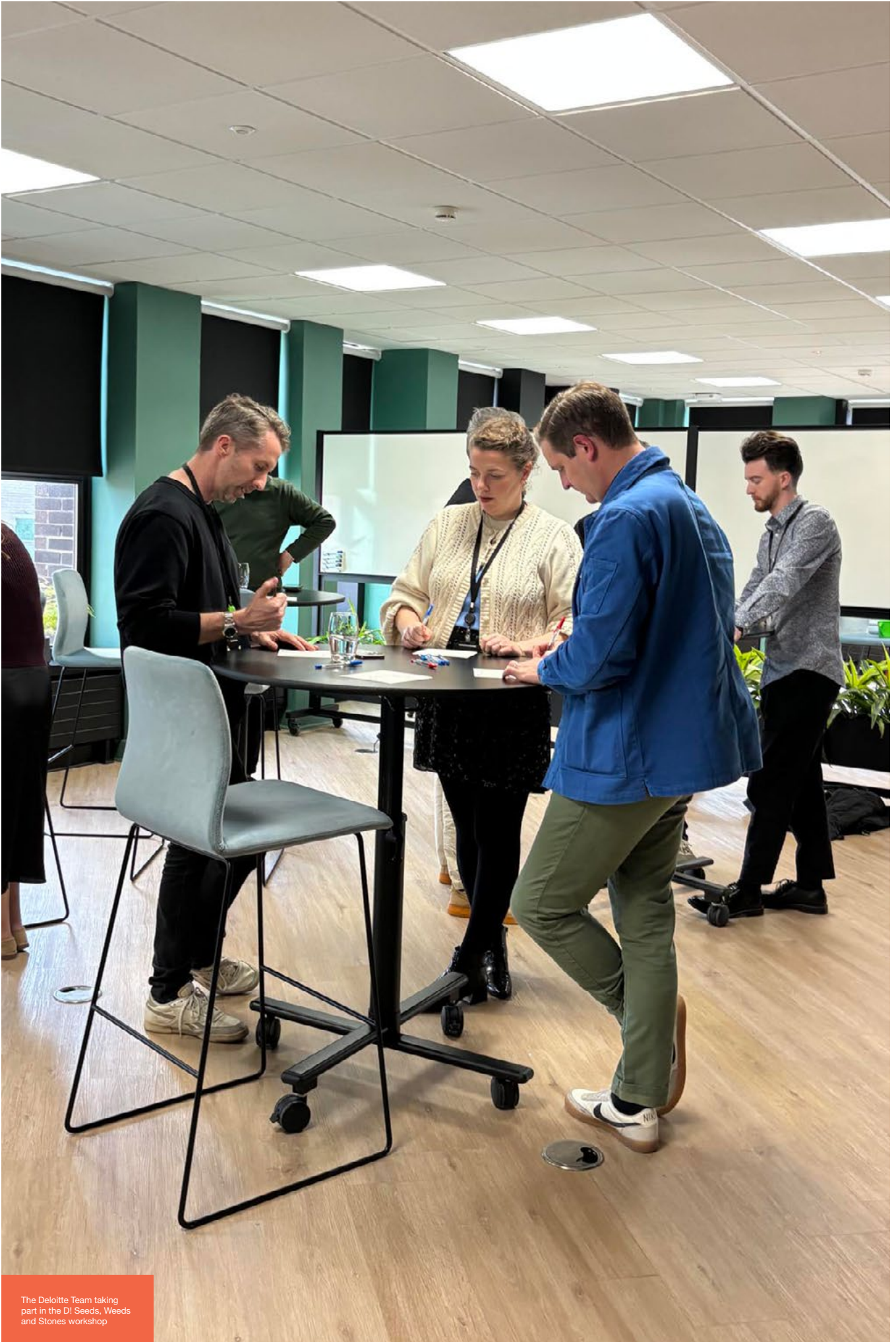
The Deloitte Team taking part in the D! Seeds, Weeds and Stones workshop