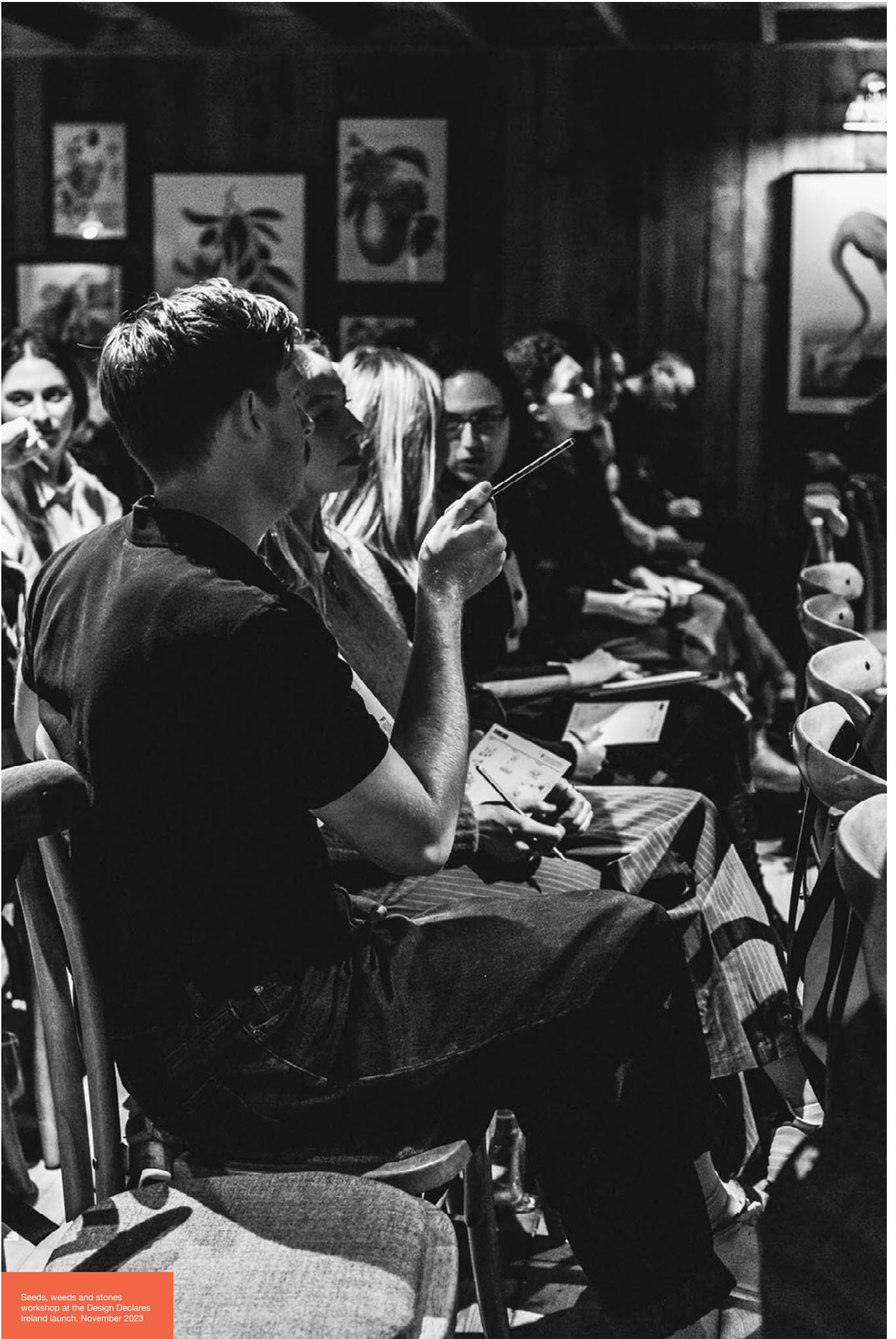
Seeds, weeds and stones workshop at the Design Declares Ireland launch, November 2023