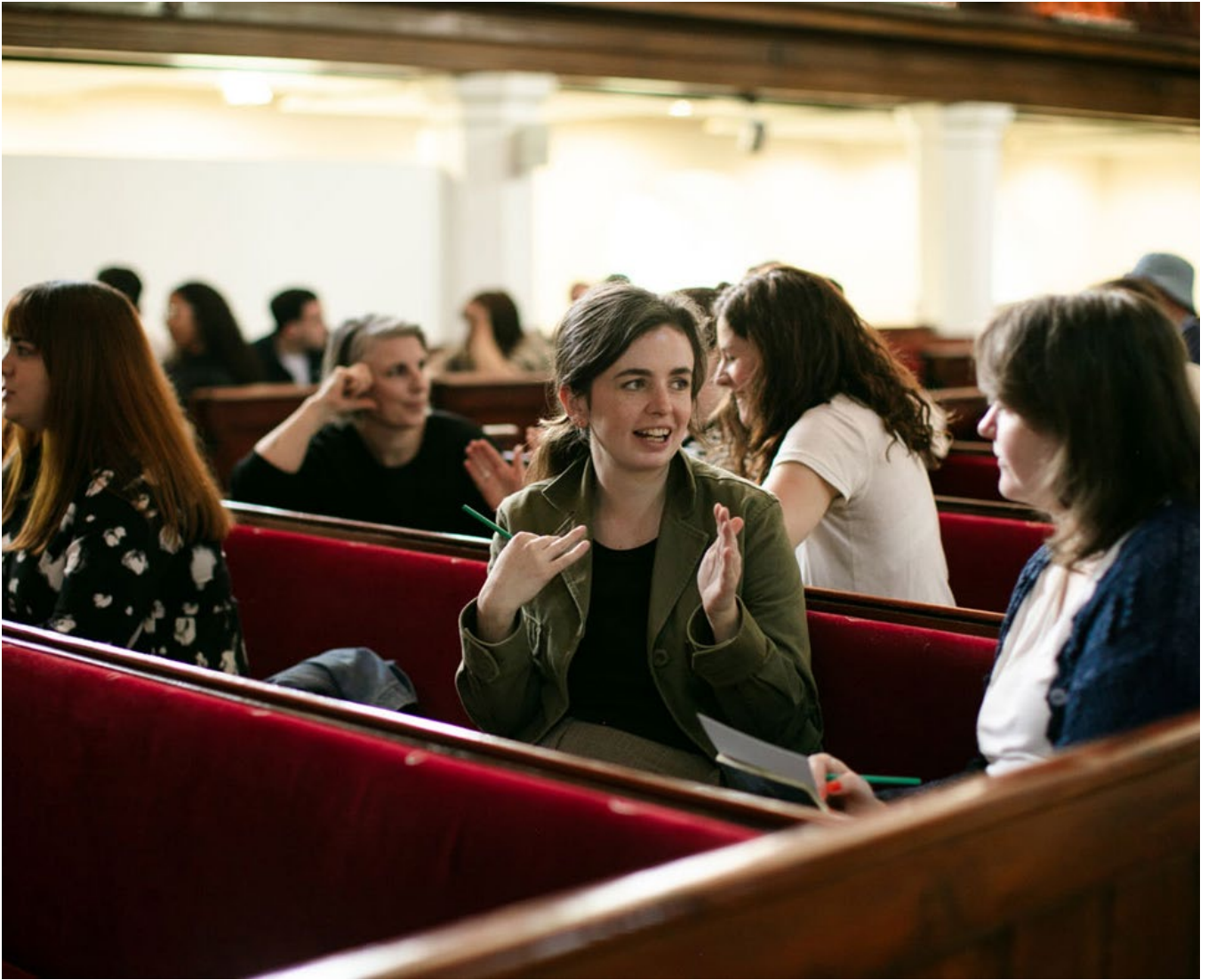
Above + Below Seeds, Weeds, Stones workshop at Stamp