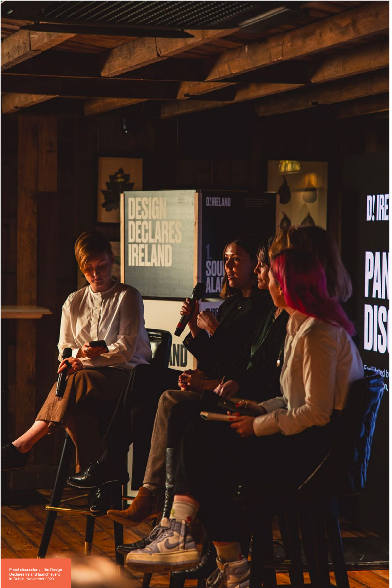
Panel discussion at the Design Declares Ireland launch event in Dublin, November 2023