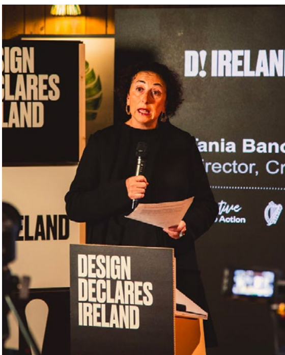
Above The audience looks on at the Design Declares Ireland launch event in the Dean Townhouse, Dublin, November 2023

Less than a year later in November 2023, and with thanks to the Creative Climate Action Fund, we launched to a packed audience of over 150 design professionals in the Dean Townhouse, Dublin; and so began the journey towards better sustainable design practice for designers, their clients, design educators and students.