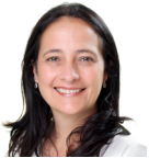
Catherine Martin, TD Minister for Tourism, Arts, Gaeltacht, Sports and Media

Before becoming a public servant she had a long career leading different creative organisations including Screen Producers Ireland and the Institute of Advertising Practitioners in Ireland. www.creativeireland.gov.ie