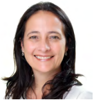
Catherine Martin, TD Minister for Tourism, Arts, Gaeltacht, Sports and Media

Before becoming a public servant she had a long career leading different creative organisations including Screen Producers Ireland and the Institute of Advertising Practitioners in Ireland. www.creativeireland.gov.ie